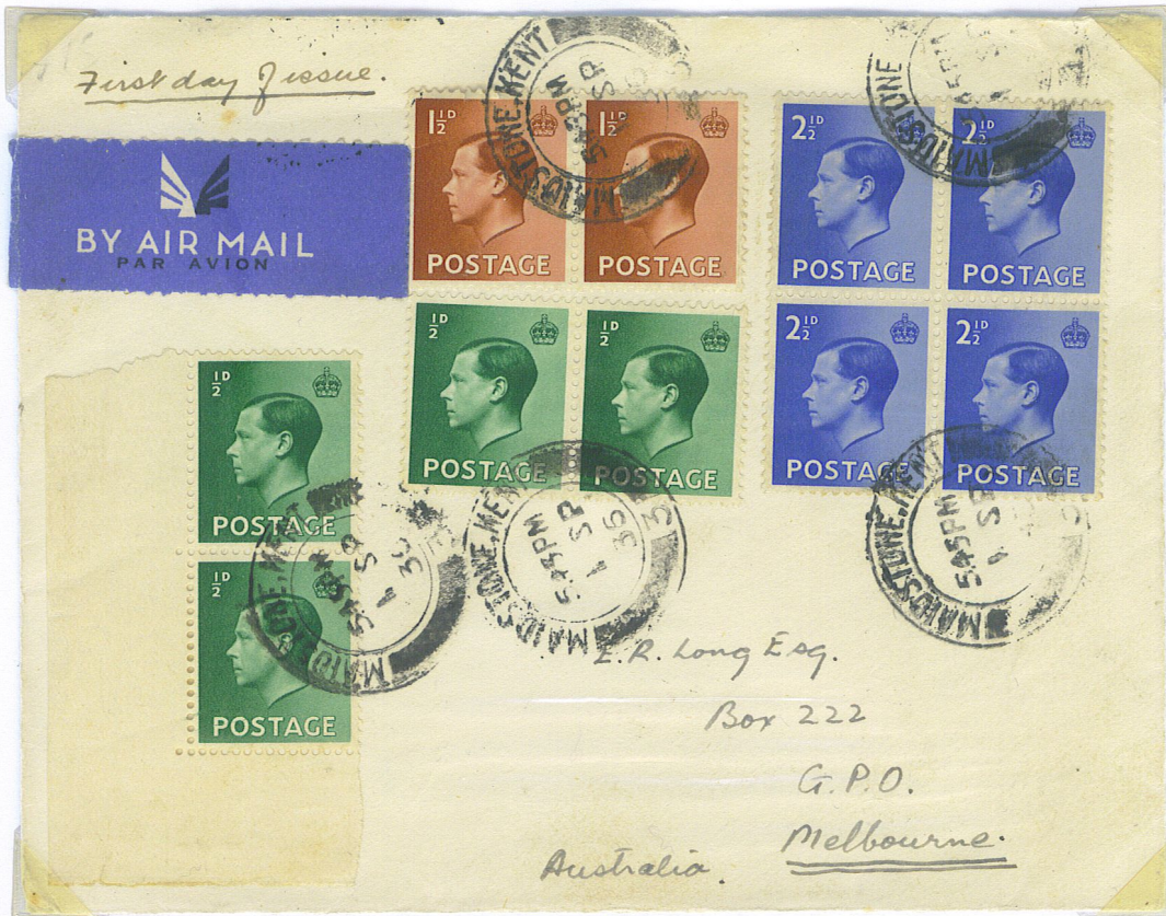
Composition of the first three values to make the one shilling and three pence airmail rate to Australia.