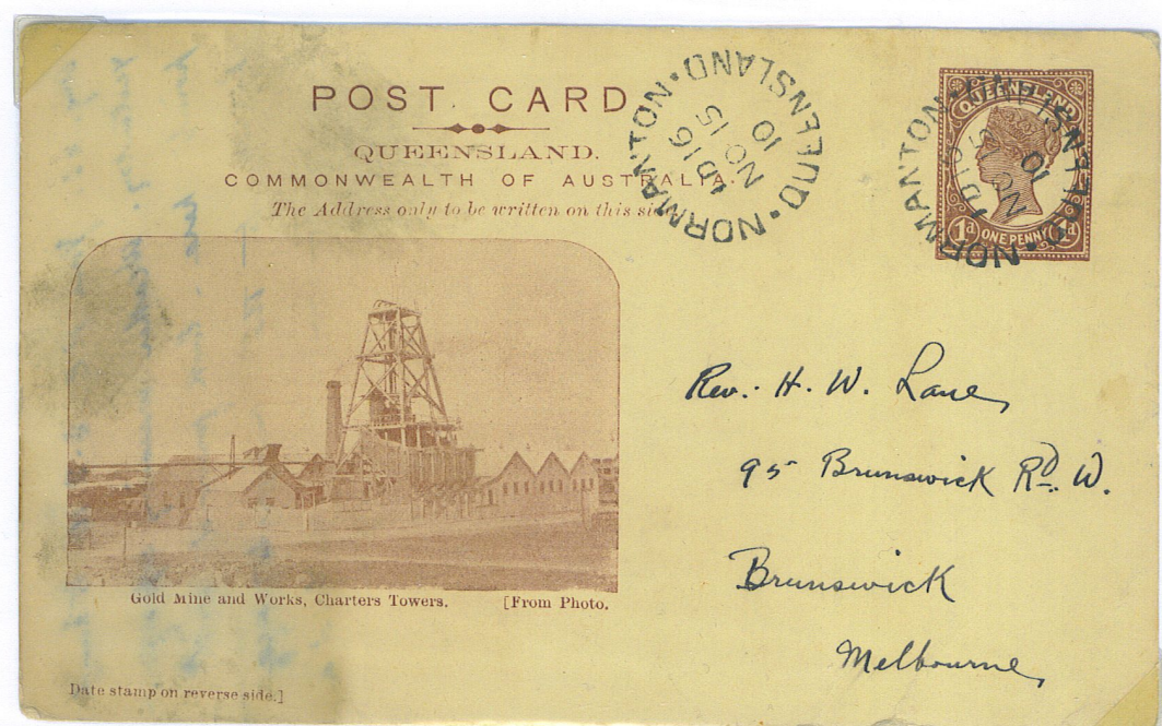
NORMANTON – Originally named Norman River, the Post Office opened in 1868 and changed its name to Normanton in 1872. Nowadays a busy little place as home to the Gulflander tourist train.