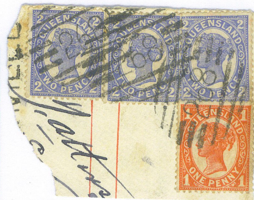
FLORAVILLE – Situated 38 miles south-east of Burketown, the P.O. opened 1883, closed 1916.