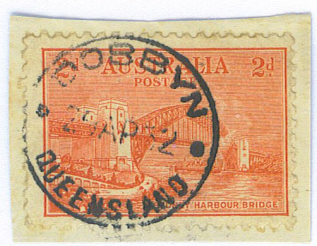
DOBBYN – A copper mining town 65 miles north west of Cloncurry. The Post Office opened in 1917, closed 1923, then reopened in 1927 and finally closed in 1961.