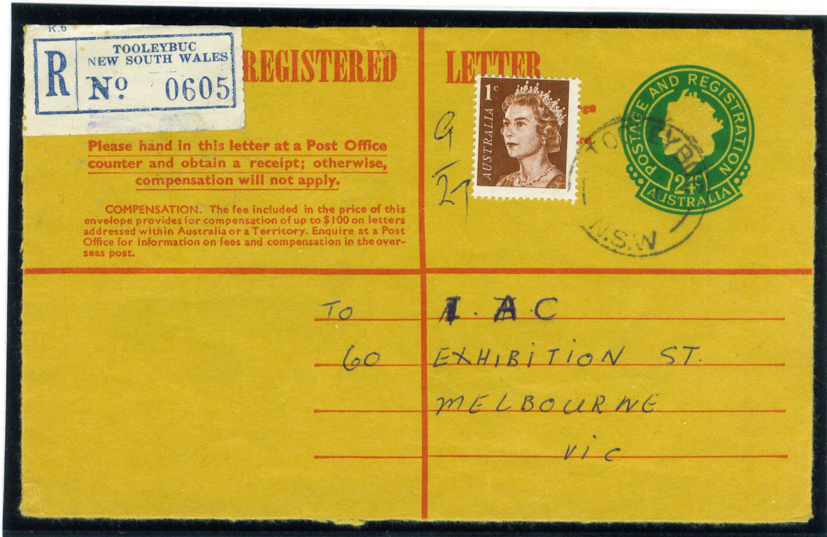
Use of the 1c as a makeup to pay the 25c registration rate on 21 July 1968