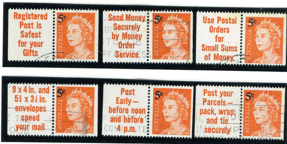
Examples of each of the six slogans used in the booklets