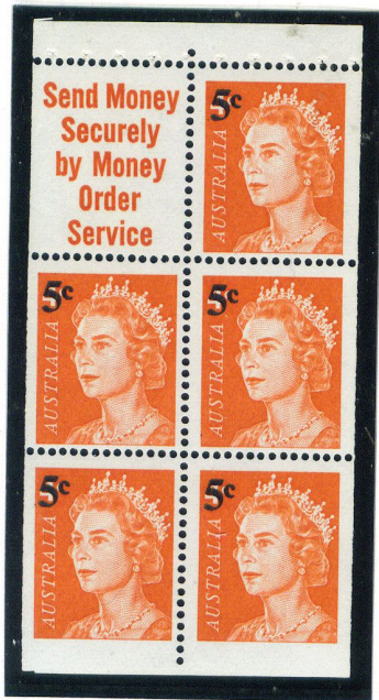
One of six overprinted booklet panes

When the basic postage rate increased from 4c to 5c on 1 October 1967, large stocks of the 4c booklet stamps were still on hand. The Post Office decided to use them up via an overprint to the new denomination, and they were sold in booklets containing either 2 or 4 panes (at 50c or $1).